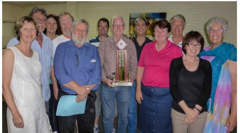
Kenmore Bridge Club won the Interclub Competition played at QCBC on Sunday 8 November.